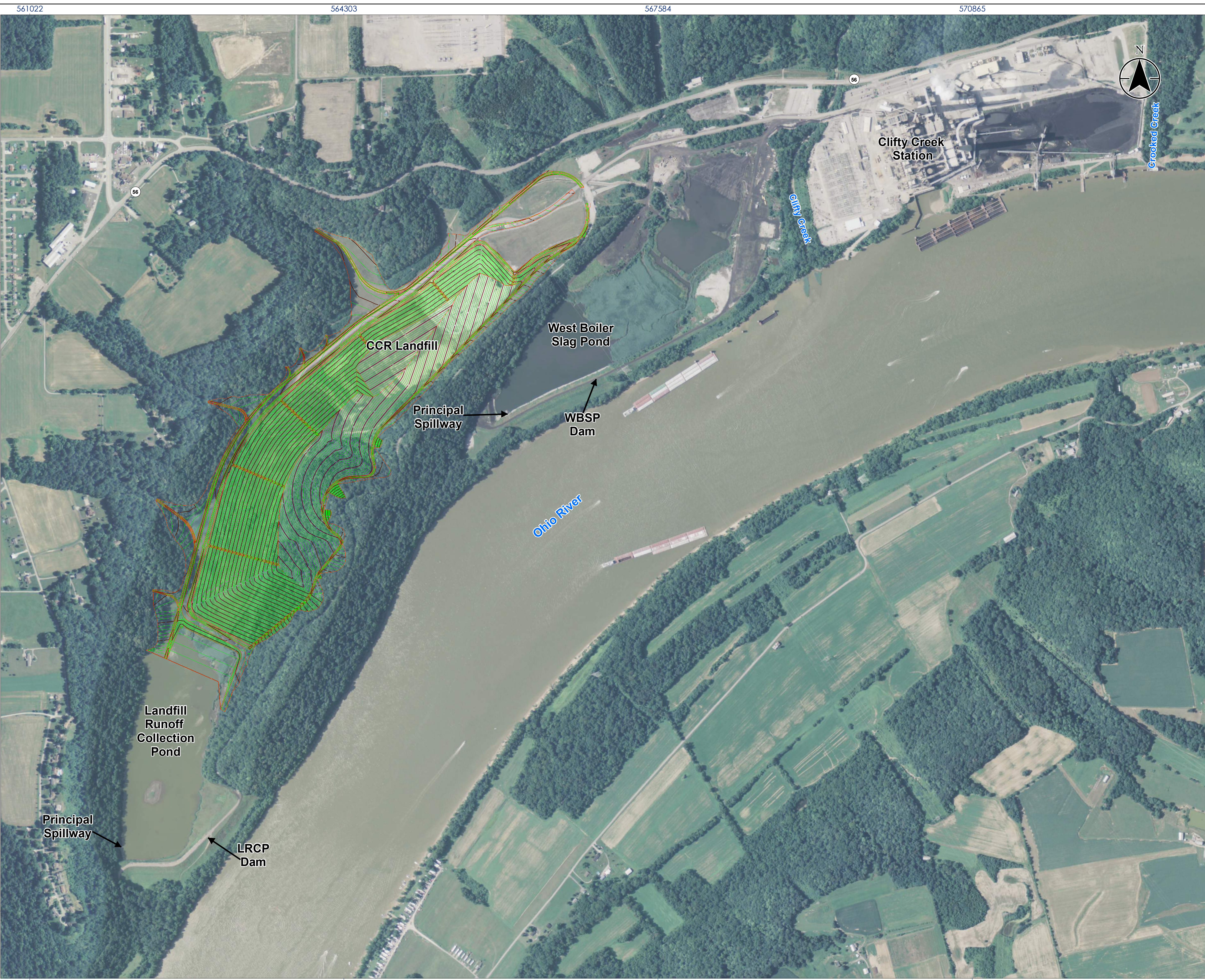
Figure No. A-1 Title Plan View of Clifty Creek Station

Client/Project Clifty Creek Station Landfill Runoff Collection Pond and West Boiler Slag Pond Project Location 175534018 Madison Jefferson County, IN Prepared by AP on 2016-10-13 Technical Review by JH on 2016-10-13 Independent Review by SH on 2016-10-13